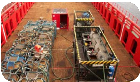
Typical Weirbox and CrudeSorb® Setup with Sparging Chemical Dosing